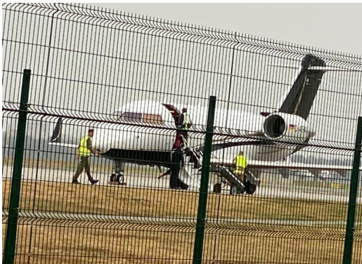
Saving lives for the sake of democracy: Evacuating Alexei Navalny to Berlin for treatment after poisoning