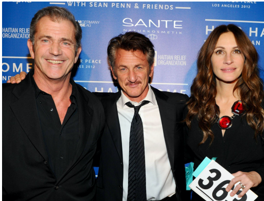
Creating Help Haiti Home for Sean Penn