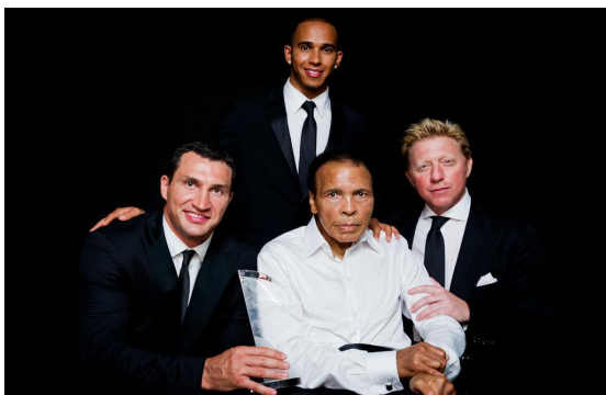
Celebrating diversity, civil rights and core values: Muhammad Ali's global farewell at the London Olympic Games with Formula 1 champion Lewis Hamilton, tennis legend Boris Becker and then- heavyweight world champion Wladimir Klitschko.