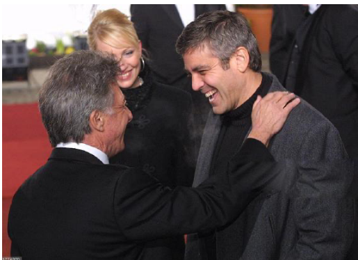
Dustin Hoffman’s and George Clooney’s remarks opposing the Iraq war, at Cinema for Peace, resonated with a global audience in international headlines.