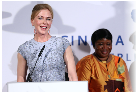
UN Women Goodwill Ambassador Nicole Kidman, and then- ICC Prosecutor Fatou Bensouda, campaigning for women’s rights and an end to violence against women at Cinema for Peace

https://www.cinemaforpeace-foundation.org/