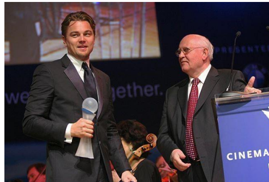
Leonardo DiCaprio and Mikhail Gorbachev initiating the “Green Oscar” at Cinema for Peace